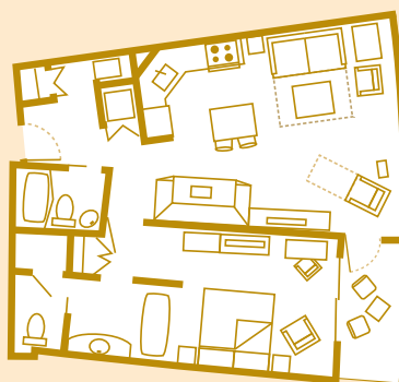
Typical 1-Bedroom Villa: 727 Sq. Ft.

A limited number of 3-Bedroom Grand Villas accommodating up to 12 Guests are available upon request.