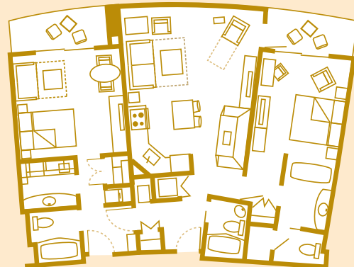
Typical 2-Bedroom Villa: 1,080 Sq. Ft.