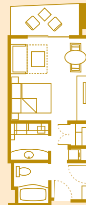
Typical Deluxe Studio: 356 Sq. Ft.